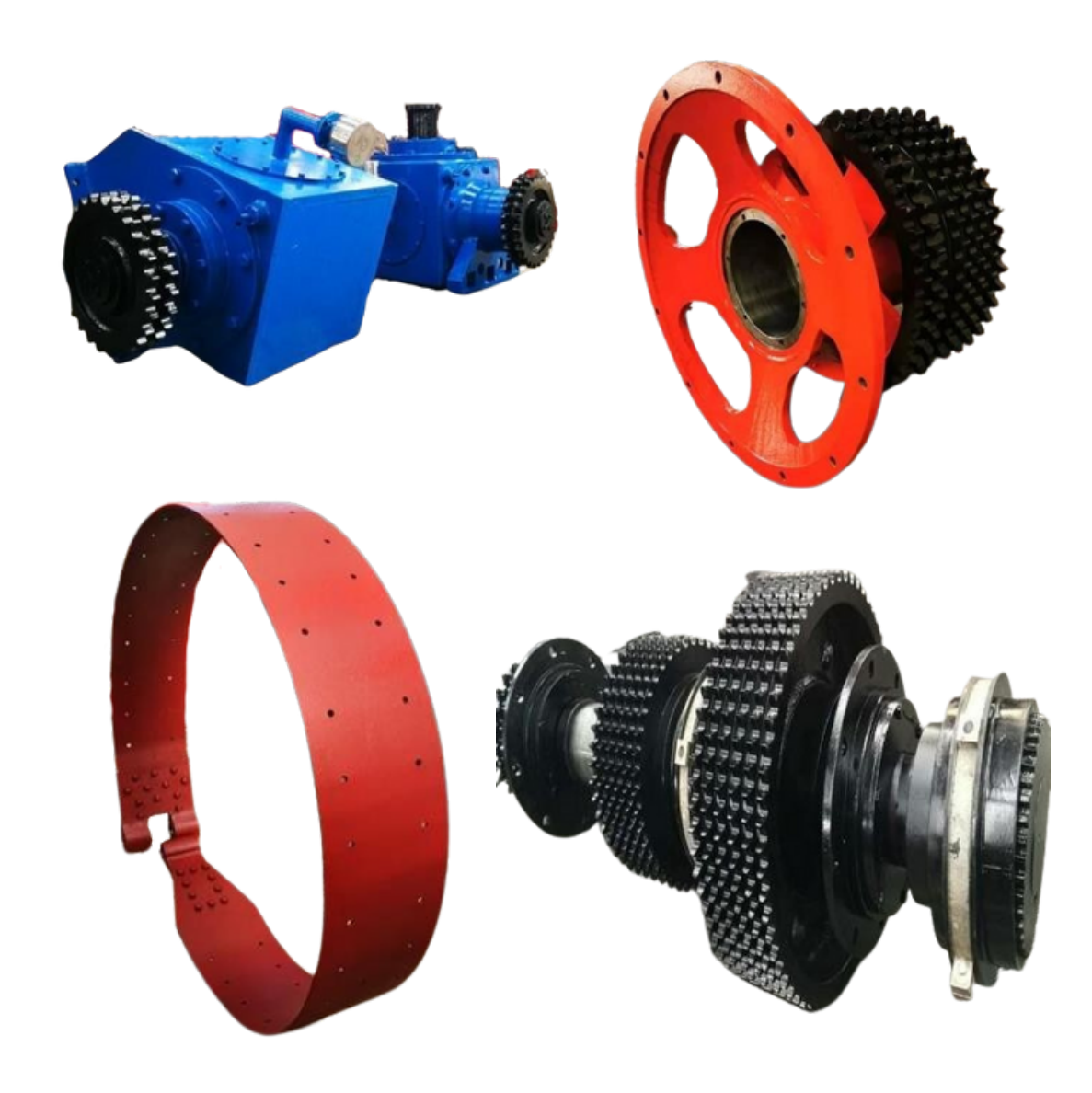
Main Products:Drilling Equipment/Solid ControlEquipment/Well Site Dog House/Round and Square Tank/ Mining Equipment and Accessories